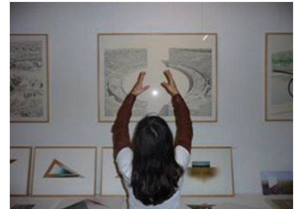
Mado, Performance au vernissage Elena Mooren et Henri Fornasari, 2010, Photo © Elena Mooren

Upcoming L'Exposition de Poche 3rd edition from May 12 to 16 in Bordeaux Presentation of the painting "Investigation of pure desire