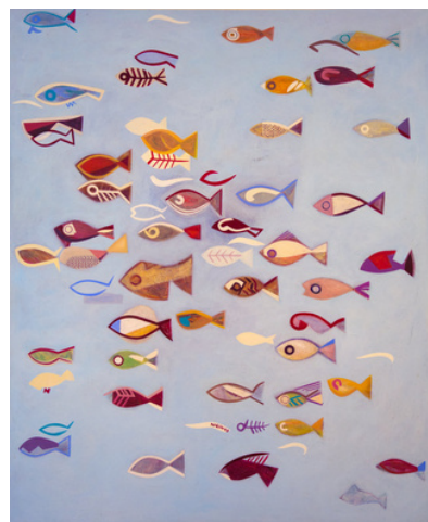
Sebastien Nadin, "Poissons rüz de marée en bleu", 2009, acrylique sur toile, 100 x 81 cm