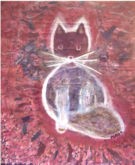
Mado, « Peinture en bâtiment convertie en chat rose », 2020, acrylique, 60 x 73 cm

Thus, within the Nadin workshop, Mado develops the desire to paint. It is in Bordeaux, that she launches at the time of the confinements Covid 2020-2021. She paints four works: "Peinture en bâtiments convertie en chat rose", acrylic, 2020, 60 x 73 cm / « Songe sur soi-même et regard aujourd'hui », acrylic on wood, 2020, street art / Of permanence in impermanence, acrylic on canvas, 2020, 60 x 73 cm and a fresco "Lapins, chats et Lune", acrylic on wood, 2020.