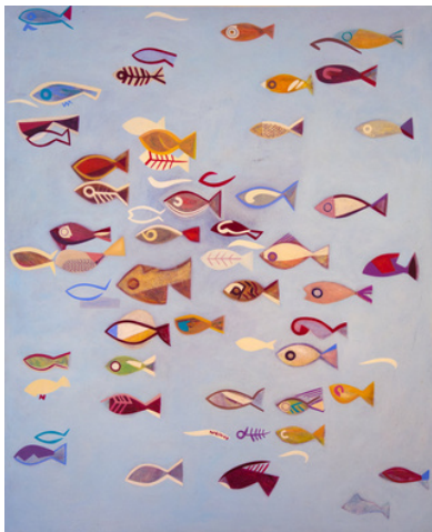
Sebastien Nadin, "Poissons raz de marée en bleu", 2009, acrylique sur toile, 100 x 81 cm